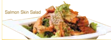
Salmon Skin Salad