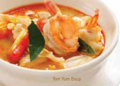
Tom Yum Soup